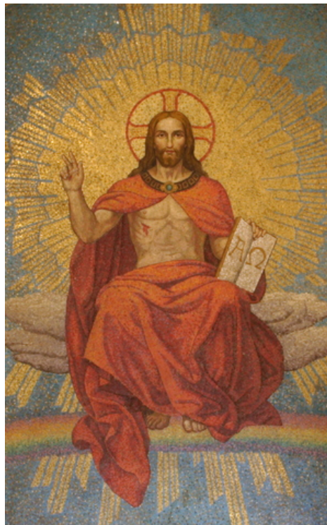
Jesus Christ the Alpha and the Omega

“Christ’s response, “Whoever has seen me, has seen the Father, “lead us into the heart of Christological faith.” — Pope Benedict XVI