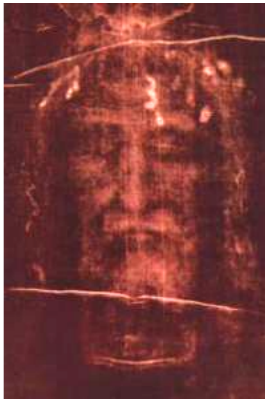
Shroud of Turin